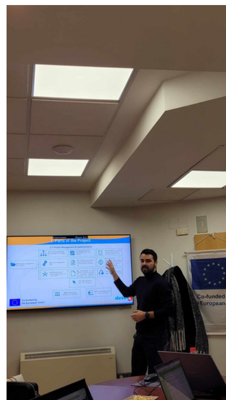
Meeting in Valladolid on 15th December

Work Package 3 is the section devoted to the development of the course's curriculum, the content of the course. Training of the trainers and final multipliers events will also be contacted at this stage of the project.